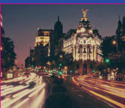
5<sup>TH</sup> HANS VAN BAALEN TOWN HALL Utrecht, The Netherlands - 2022 Organised together with VVD