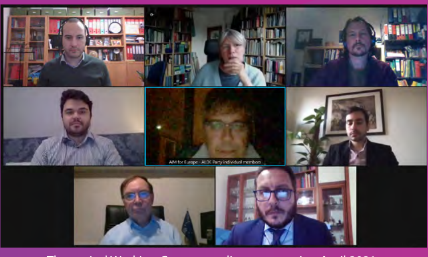
Thematical Working Group coordinators meeting April 2021

Not yet an individual member or a liberal associate? Find out more information on how to join at aldeparty.eu